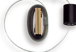
External pressure monitor